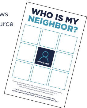
chart. This chart allows you to identify individuals or families around you whether at work, school, or around your home, that you can be praying for and sharing the Gospel with. Pick up a chart in the lobby!

Register today at HickoryGrove.org/Evangelism and purchase your copy of Sharing Jesus Without Freaking Out in the Resource Center.